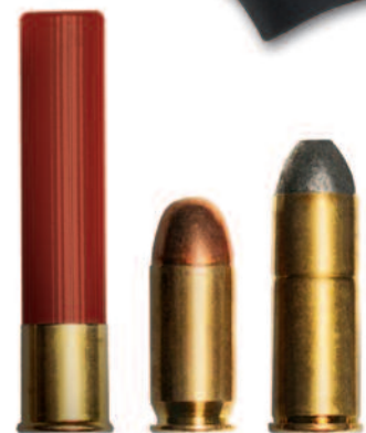
.410 2-1/2" Shotshell

Model: GOVERNOR™ Product Code: 162410 Caliber: .410 2-1/2" Shotshell, .45 ACP, .45 Colt Capacity: 6 Rounds Action: Single/Double Action Barrel Length: 2-3/4" Front Sight: Dovetailed Tritium Night Sight Rear Sight: Fixed Overall Length: 8-1/2" Overall Height: 5-1/2" Overall Width: 1-3/4" Weight: 29.6 oz. Grip: Synthetic Material: Scandium Alloy Frame/Stainless PVD Cylinder Finish: Matte Black Other Features: 2-Round and 6-Round Moon Clips Included For Use with .45 ACP UPC Code: 022188624106 Launch Date: February 2011