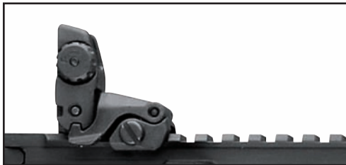
Magpul® MBUS® Folding Sights

Availability subject to applicable federal, state and local laws, regulations, and ordinances.