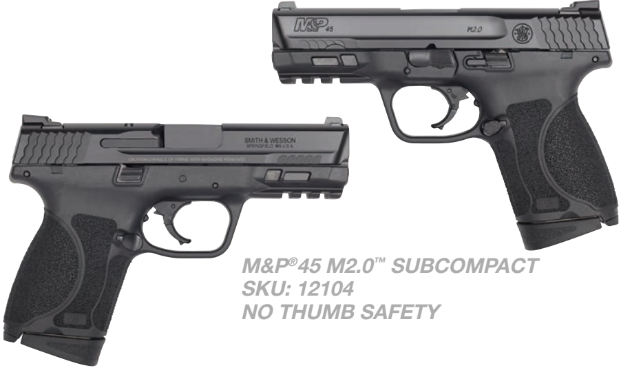
M&P®45 M2.0™ SUBCOMPACT SKU: 12104 NO THUMB SAFETY