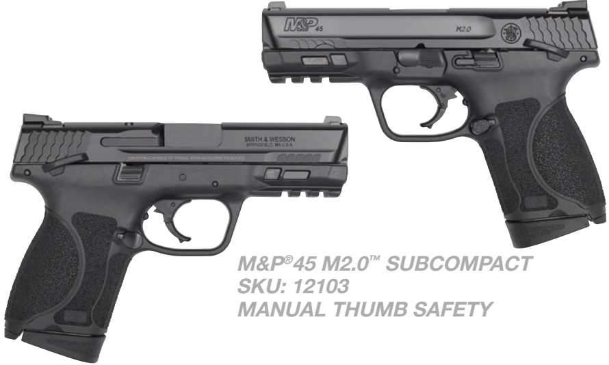
M&P®45 M2.0™ SUBCOMPACT SKU: 12103 MANUAL THUMB SAFETY