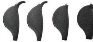
Total of four interchangeable palmwell grip inserts.