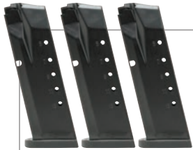
Three - 13-Round 40 S&W Magazines Included SKU: 3008591 UPC Code: 022188874297